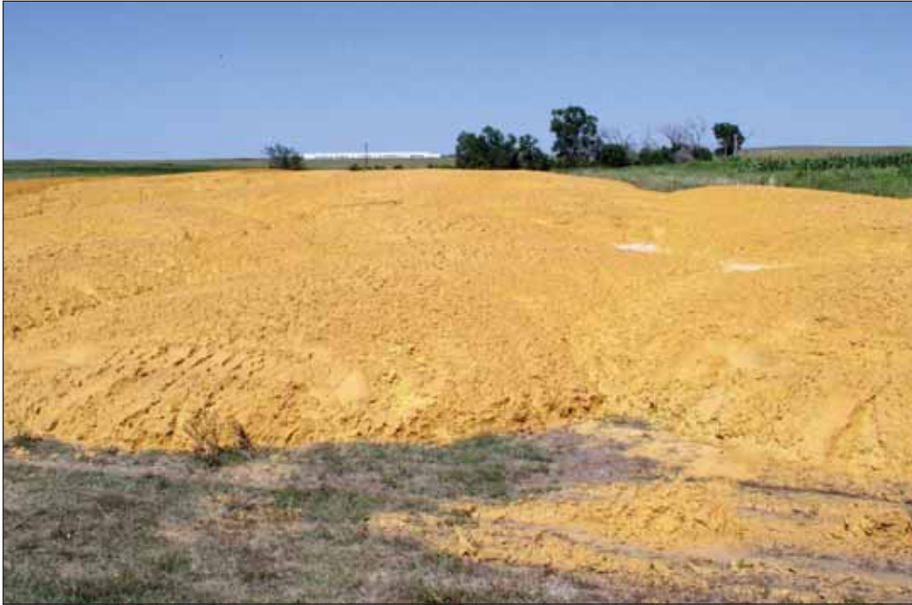
Figure 18. Piling WDGS on the ground and storing with no cover or bunkers.