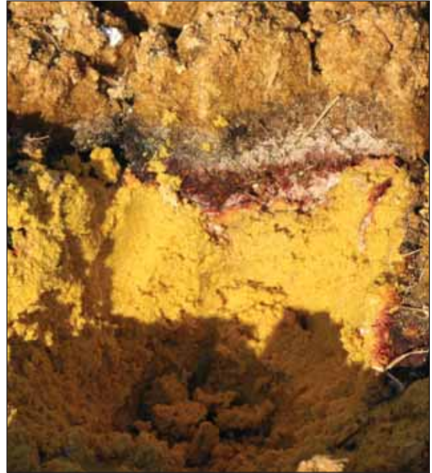
Figure 20. Piled and stored WDGS illustrating drying out at the surface and mold growth on the top few inches.

performance between DDGS, WDGS and a 67% WDGS and 33% ground wheat straw mixture (DM basis) stored in bags for 30 days prior to initiation of the trial. Steers were supplemented one of four levels of co-product: 0.0, 2.0, 4.0 or 6.0 lb. of distillers grains daily. The base diet consisted of 60% sorghum silage and 40% alfalfa hay with supplement top-dressed. Gain increased linearly with increasing levels of co-product supplementation (1.52 to 2.62 lb./day). Steers supplemented the mixture had lower dry matter intake (DMI) compared to DDGS and WDGS ( P=0.05 ) because of the straw; however, feed conversion was not reduced. In Exp. 4, 96 steers were used to determine palatability of WDGS mixed with wheat straw. Steers were fed either 50% WDGS and 50% wheat straw mix, or 60% WDGS and 40% wheat straw mix. A base diet containing 60% sorghum silage and 40% alfalfa hay was also fed either simultaneously or a minimum of four hours post feeding the assigned level of WDGS and wheat straw mix. Calves fed 60% WDGS gained more than calves fed 50% WDGS