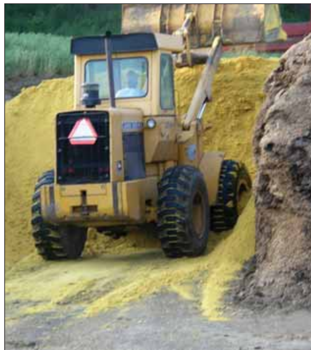
Figure 16. Piling modified WDGS (42-50% DM) straight in a bunker.

Modified WDGS that is 42-50% DM and WCGF that is either 45% or 60% DM does pile and may be stored in a bunker by itself without forage added. However, the pile cannot be compacted by driving equipment onto the feed in a bunker. There are numerous examples of producers that have piled and covered either WCGF or MWDGS and had little spoilage (except on the top surface as would be expected). In Figure 16, piling of MWDGS appears to work in either earthen bunkers or concrete bunkers. We would always recommend covering with plastic or some mechanism to minimize spoilage at the surface. This storage method of just piling either MWDGS or WCGF is “riskier” in terms of spoilage