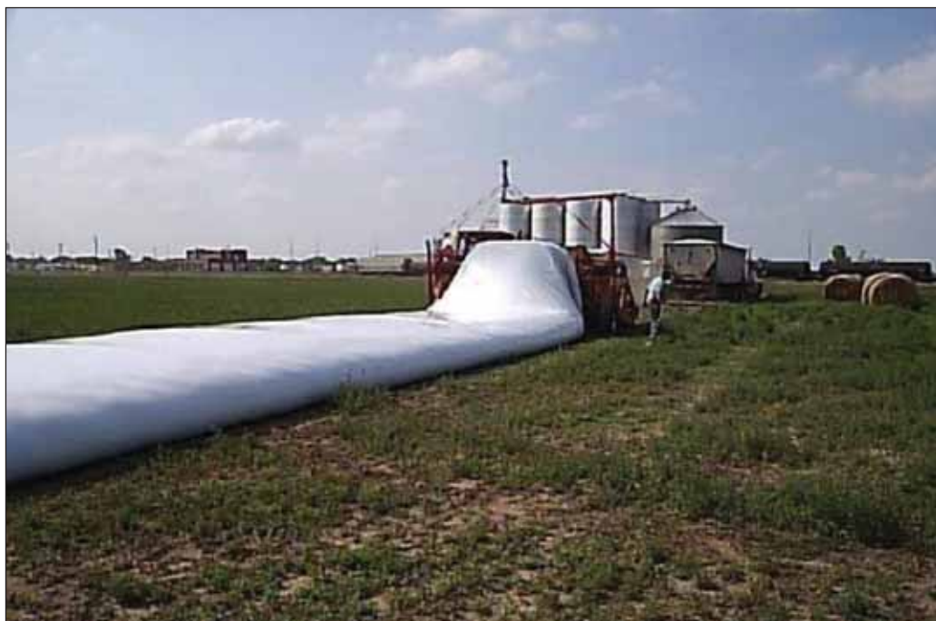
Figure 3. Bagging straight WDGS with no pressure. WDGS can be bagged with no forages or other feeds added; however, the bagger cannot apply pressure during bagging.

The main challenge with storage of WDGS (35% DM, 65% moisture) is that the material is not able to be compacted during storage. Therefore, bulking agents are needed to either dry the material, to add bulk or both. Dry forages are the most logical source to add bulk to WDGS. However, other dry feeds may be used. Modified WDGS and WCGF appear to have enough bulk to be able to store in silo bags under pressure (300 psi or greater). It should be noted that WDGS (35% DM) can be stored in silo bags under no pressure with little risk of splitting bags (Figure 3). However, this storage method is less efficient in terms of storage area and use of bags and may allow for some air pockets with no pressure added to the bag.