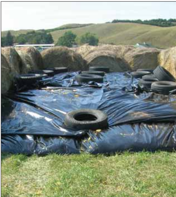
Figure 14. WDGS piled and covered in the same bunker as Figure 13.