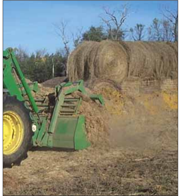
Figure 11. Mixing of grass hay and modified WDGS at a ranch using a front-end loader. The modified WDGS was unloaded on the ground with hay in layers and pushed together with a front-end loader. For cow-calf producers, this may be mixed enough to ensure proper storage and still be adequately mixed for feeding.

First, the forages need to be ground or at least a sufficient particle size to adequately mix with WDGS.