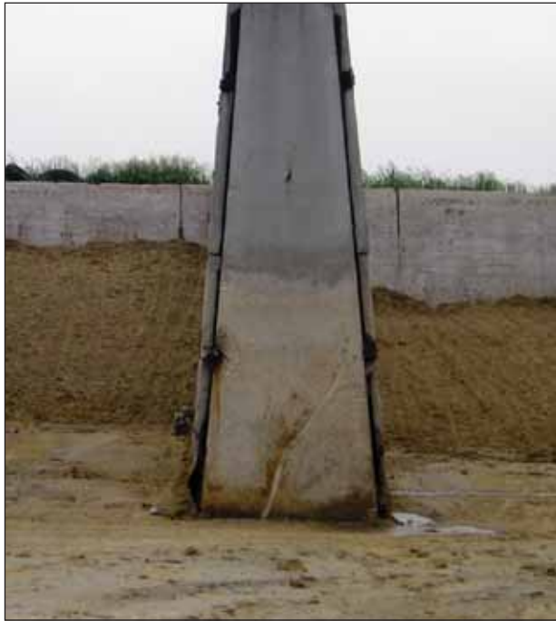
Figure 7. Initial bunker tests with 70% WDGS and 30% grass hay (on the right) and 60% WDGS and 40% grass (on the left). Mixtures are on a DM basis.