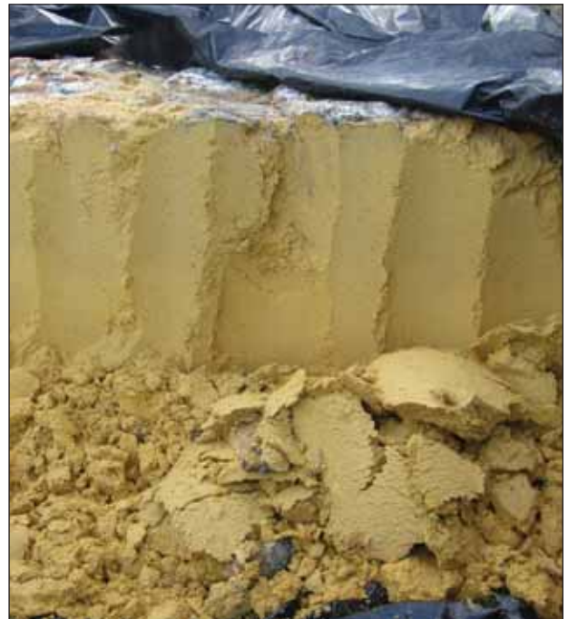
Figure 15. WDGS piled and covered in the same bunker as Figure 13 illustrating a small layer of spoilage across the surface, but little change within the pile.