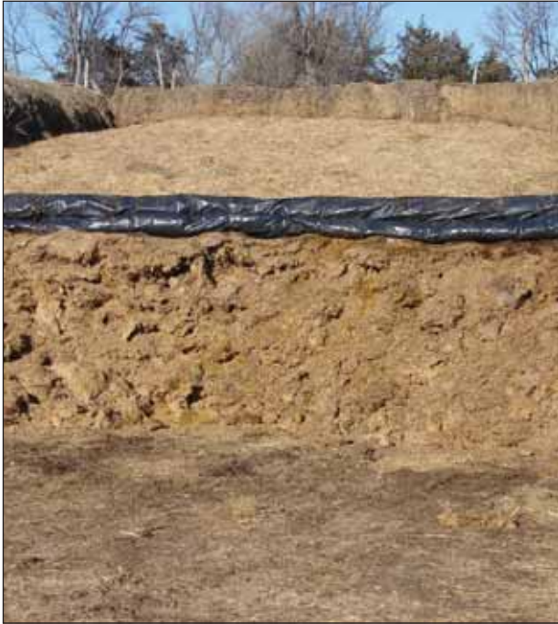
Figure 10. Grass hay and modified WDGS (45% DM) mixed in a bunker made of round bales, covered in plastic and ground hay. Mixture is 15% grass hay and 85% modified WDGS (DM basis).

Neb. The mixtures used were 20% wheat straw and 80% WDGS (as-is basis) for both years. Assuming the WDGS is 35% DM and the wheat straw is 90% DM, this equates to approximately a ratio of 39% wheat straw and 61% WDGS on a DM basis. In year 1 (Figure 8), the pile was covered and bales were used for sides. In year 2 (Figure 9), the pile was larger and, again, covered in plastic with bales used for sides.