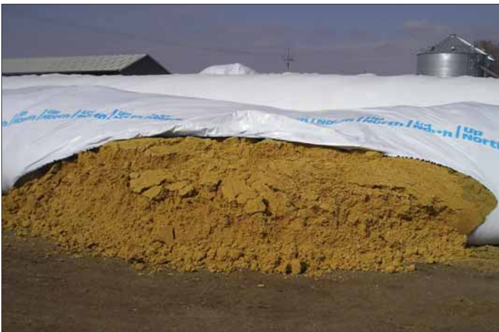
Figure 4. Consequence of bagging straight WDGS under pressure (300 psi) or without enough forage or other bulking agents to allow for pressure during bagging.

To determine the amount of feeds to weigh out, producers need to accurately account for the mixture needed on a DM basis, and then calculate the as-is percentages so that feeds can be weighed out. This process is similar to combining feeds at the time of feeding into mixing equipment. With wetter feeds such as WDGS, the as-is percent inclusion of forage is significantly less than the mixture on a DM basis.