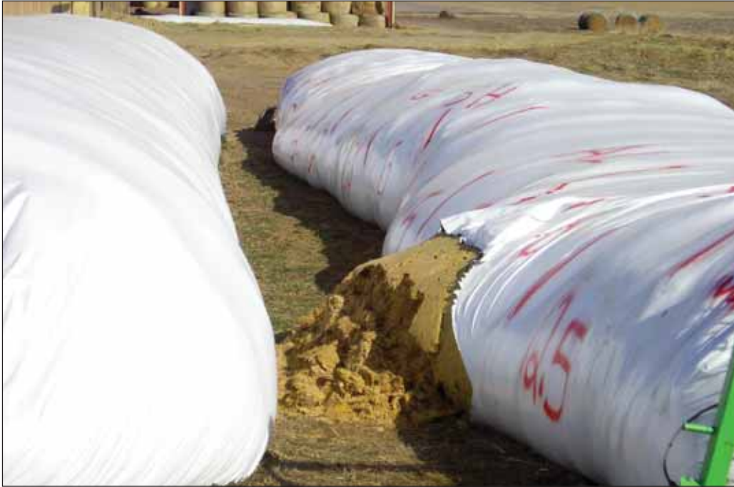
Figure 5. Bagging WDGS with experimental mixtures of different forages and amounts of forage. This picture illustrates the different height and width of silo bags depending on forage or dry feed added. We evaluated the lower limits required and did break the bag when too little forage was added.

Table 1 provides example calculations for determining the mixture on an as-is basis from the mixture provided on a DM basis, along with the DM of each ingredient.