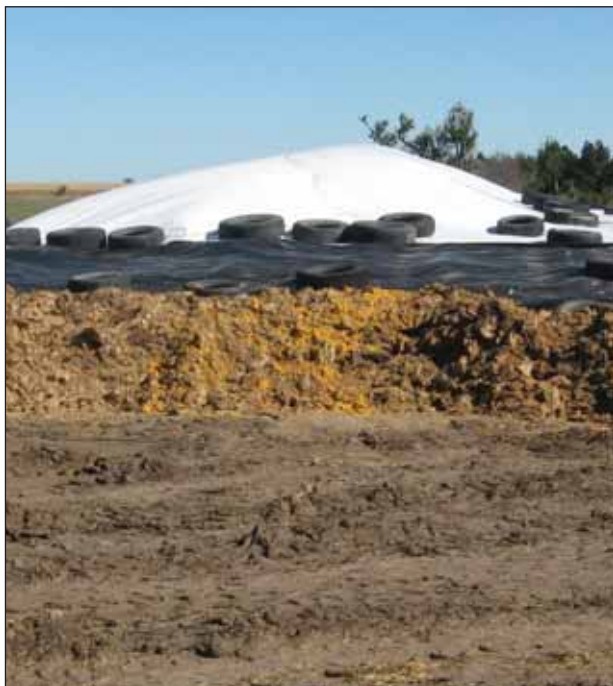
Figure 9. Same producer with a similar mixture as Figure 8 from the second year. The mixture was 20% wheat straw and 80% WDGS (as-is basis), which is 38-40% straw on a DM basis.

bunker with little spoilage. In this example, dry cows were fed this mixture in a dry lot situation.