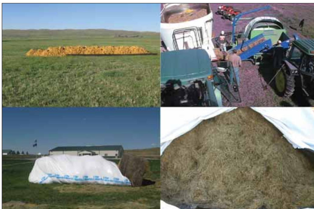
Figure 6. WDGS piled on a meadow in the Nebraska Sandhills, and mixed with 56% grass hay (DM basis) using a vertical mixer that bales were loaded directly into. Storage worked well and the mixture was supplemented to grazing cows.

We initially mixed 30% grass hay with 70% WDGS (DM basis) and packed with a skid loader with rubber tracks. This mixture worked fine and compacted; however, the weight of a pay loader was not maintained on the pile. A bunker with 40% grass hay with 60% WDGS (DM basis) did compact in the bunker and yet maintained the weight of a pay loader (Figure 7). Similar to bagging, forage sources can likely be exchanged on an equal fiber (i.e., NDF) basis. For example, 29% corn stalks was successfully stored with 71% WDGS in a