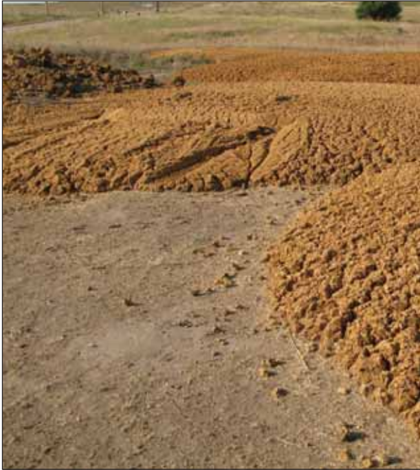
Figure 19. Similar piles of WDGS following a few months of storage while exposed at the surface.