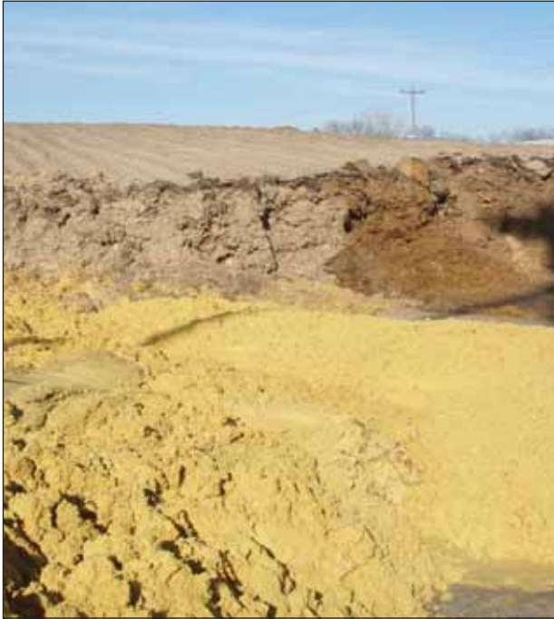
Figure 12. Concrete bunker with 85% WDGS and 15% wheat straw (as-is). The straw was ground through a 1-in. screen. In the foreground is straight WDGS being fed fresh. The bunker contains 9,000 tons of WDGS all mixed through vertical mixers.