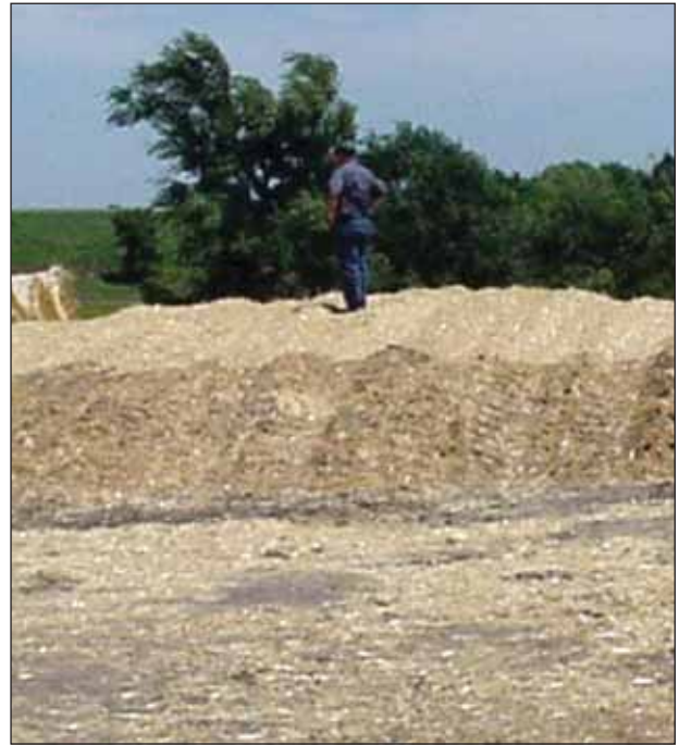
Figure 8. Cow-calf producer with a mixture of 20% wheat straw and 80% WDGS (as-is basis), which is 38-40% wheat straw on a DM basis.