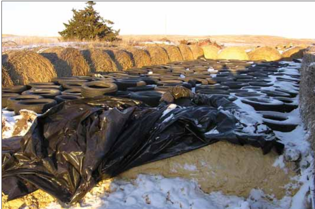
Figure 17. WDG (without solubles) stored straight in a bunker lined with plastic and round bales. The pile was treated on the surface with 1 lb. of stock salt per square foot then covered in plastic.

to handle 1 or 2 semi-loads. Therefore, purchasing large quantities (much more than 2 semi-loads) may not be feasible if the solubles are handled as a liquid. Handling distillers solubles brings challenges inherent in all liquid feeds such as equipment and pumps, circulation of the liquid to ensure that “settling” does not occur or separation and the potential for freezing in cold temperatures. Therefore, one option that may be possible is to store distillers solubles mixed with forages in either bags or bunkers. This may allow producers to purchase large quantities and store them for later use, regardless of temperature.