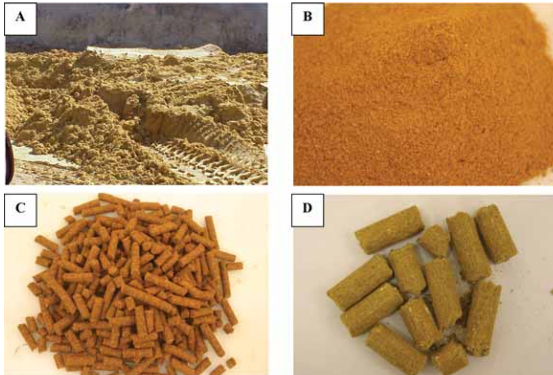
Figure 1. Different forms of distillers grains: A. WDGS (approximately 35% DM), B. DDGS in a meal form (90% DM), C. DDGS in a pelleted form (3/8 in. pellet, 90% DM, approximately 96% DDGS) and D. DDGS in a cube form (3/4 in. cubes, 90% DM, approximately 70% DDGS).

Three types of distillers grains can be produced that vary in moisture content. Ethanol plants may dry some or all of their distillers grains to produce dry distillers grains plus solubles (DDGS; 90% dry matter [DM]). However, many plants that have a market for wet distillers locally (i.e., Nebraska) may choose not to dry their distillers grains due to cost advantages. Wet distillers grains plus solubles (WDGS) is 30-35% DM. Modified wet distillers grains plus solubles (MWDGS) is 42-50% DM. It is important to note that plants may vary from one another in DM percentage, and may vary both within and across days for the moisture (i.e., DM) percentage. Figure 1 depicts different forms of distillers grains that may be used by beef producers. There are advantages and disadvantages to each of these feeds.