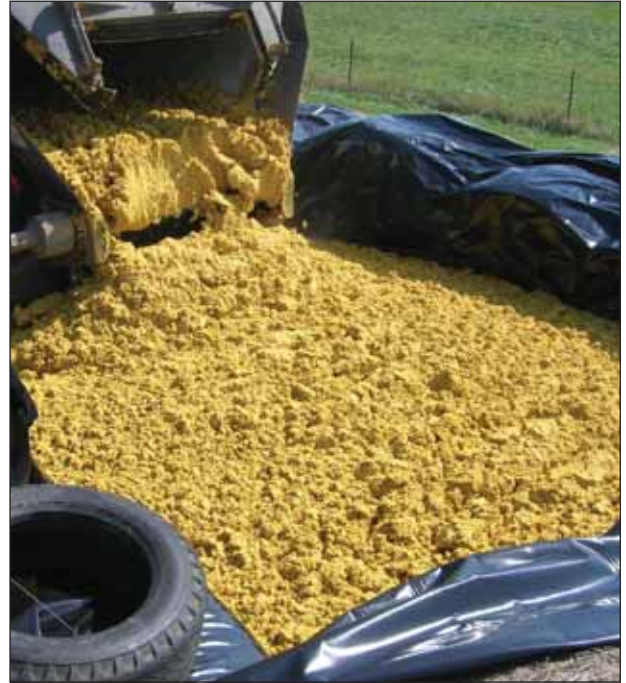
Figure 13. Piling WDGS (30-35% DM) and covering in a bunker made of round bales.